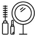
Cosmetics & Personal Care